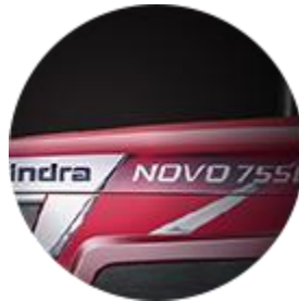
Metallic Colour & decals

Jerry can weight specially designed for muscular looks.