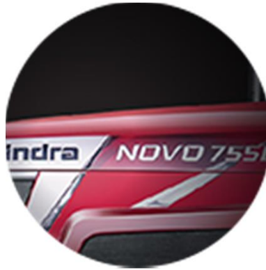
Metallic Colour & decals

Jerry can weight specially designed for muscular looks.