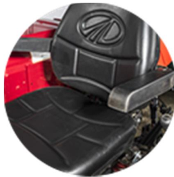
4-way Adjustable Deluxe Seat

4-way adjustable captain seat with arm rest for ease in operation.